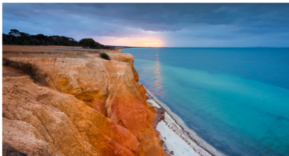
Red Banks Beach, Kangaroo Island.

SA Power Networks will construct a 150-kilometre fibre optic cable connecting Kangaroo Island with the mainland in a bid to boost connectivity for the local community.