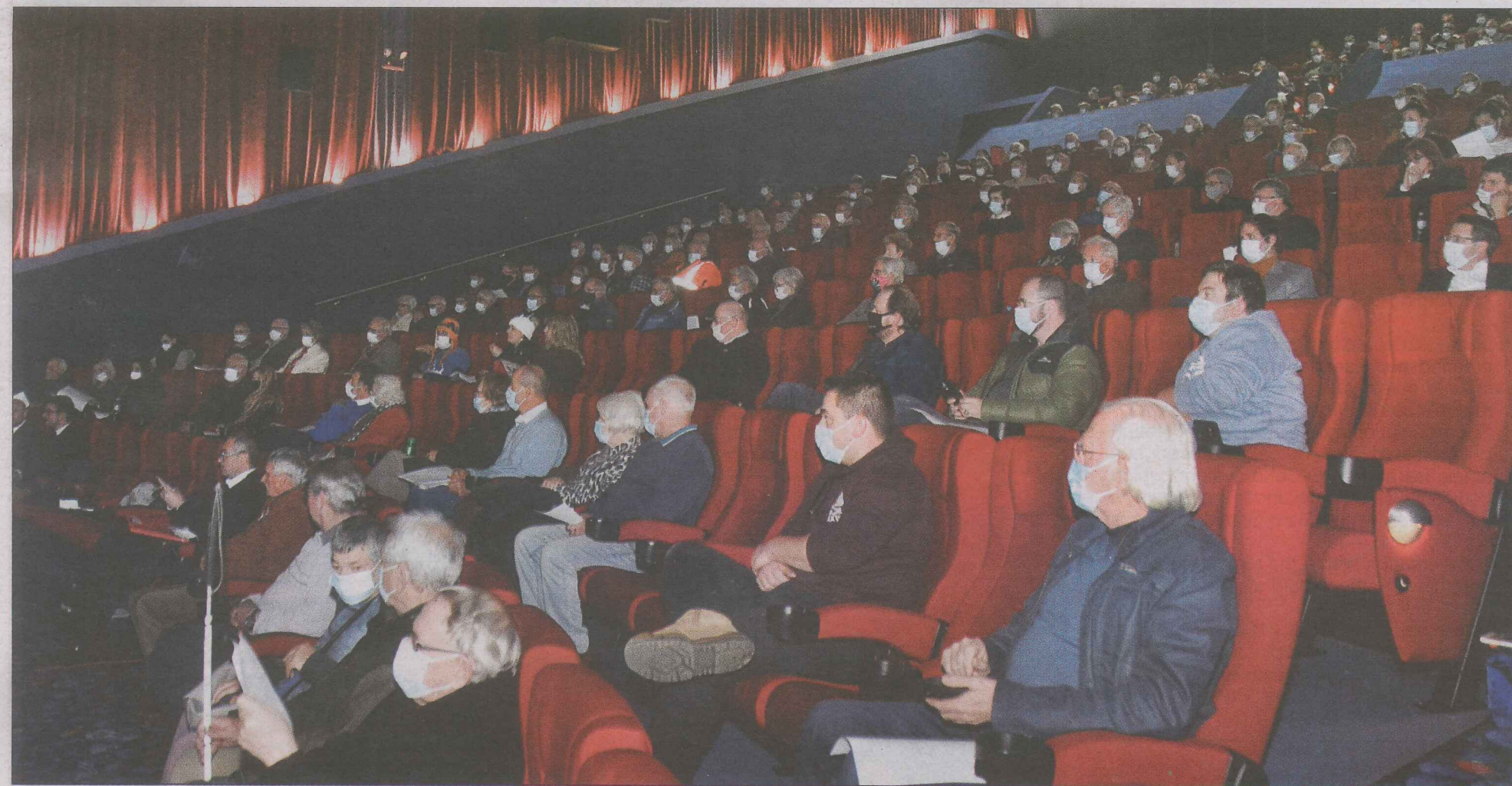
A public meeting to discuss solutions to the growing freight and public transport issues in the region attracted about 250 people to the cinema in Mt Barker last week.