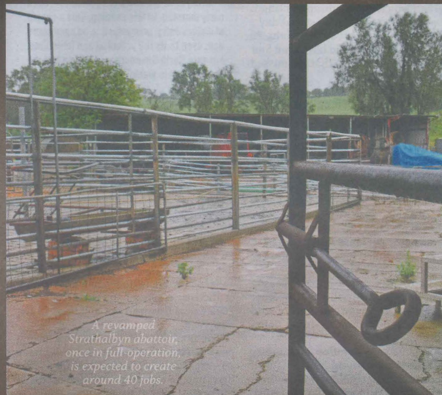
A revamped Strathalbyn abattoir, once in full operation, is expected to create around 40 jobs.