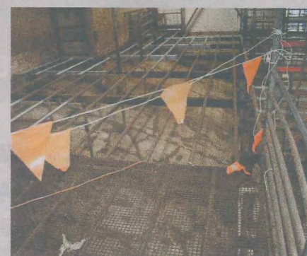
Previously stalled works on Strathalbyn abattoir's $3.5 million revamp will recommence following the execution of the associated deed.

"The Government, through SA Financing Authority, are working very closely with representatives from the Fleurieu Community Co-operative to